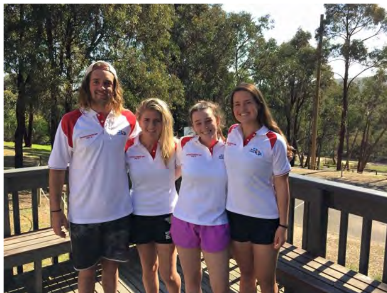
2015 – 16 Gold Medallion Recipients