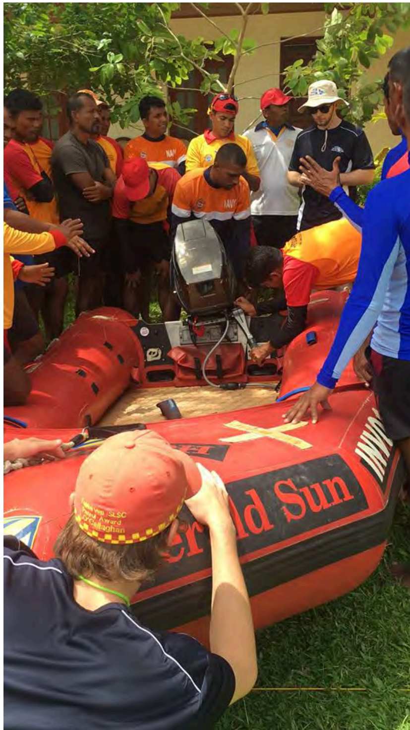
ISLSC donated IRB in Sri Lanka