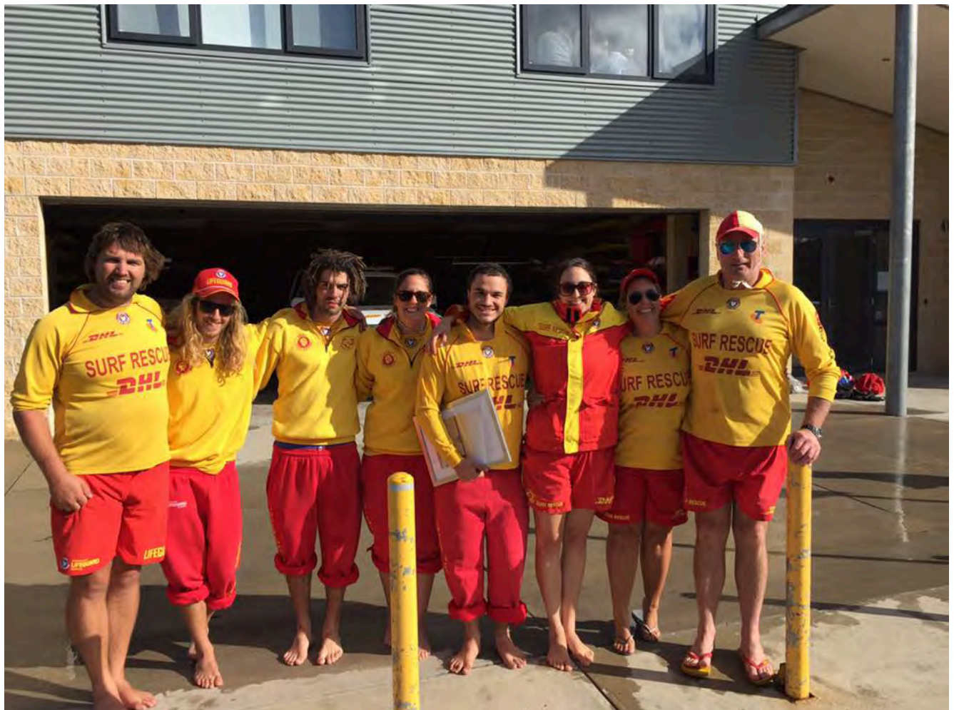
Eagles Patrol Day