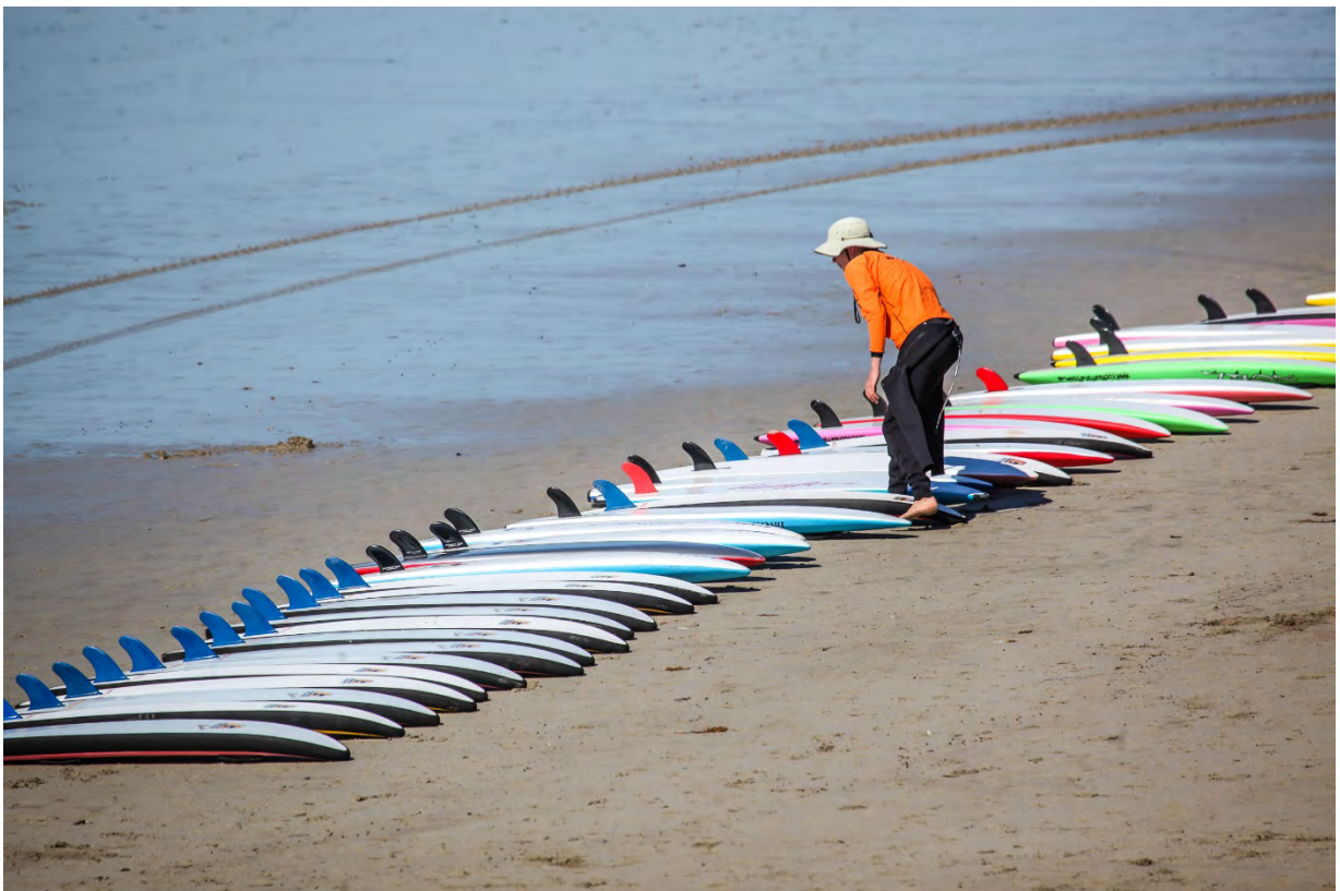
Getting Ready for Nipper Action