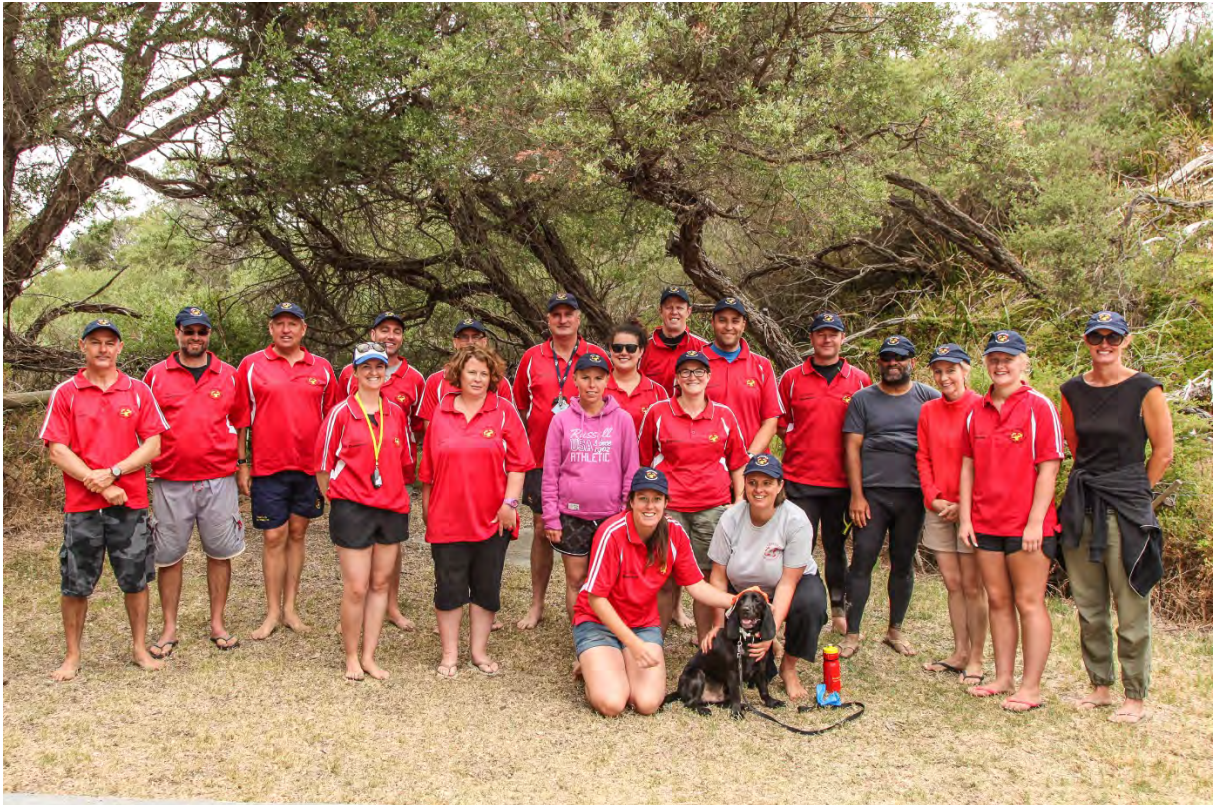
The Nipper Team