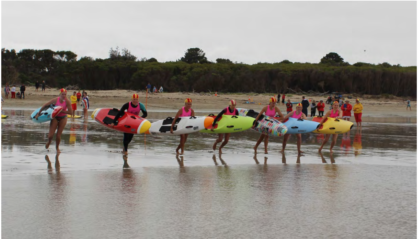
Female Board Race at the 2015/16 Club Champs (All Ages)