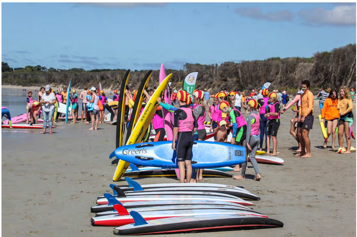
"Time for a Nipper Board Meeting"