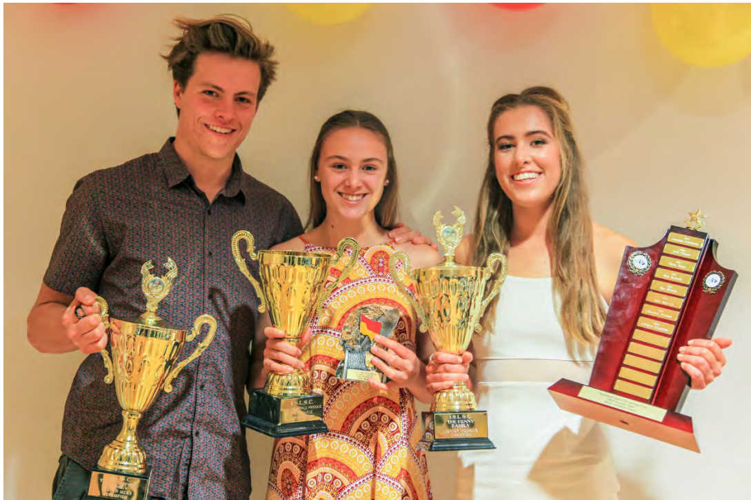
The Hughes Family of Champions