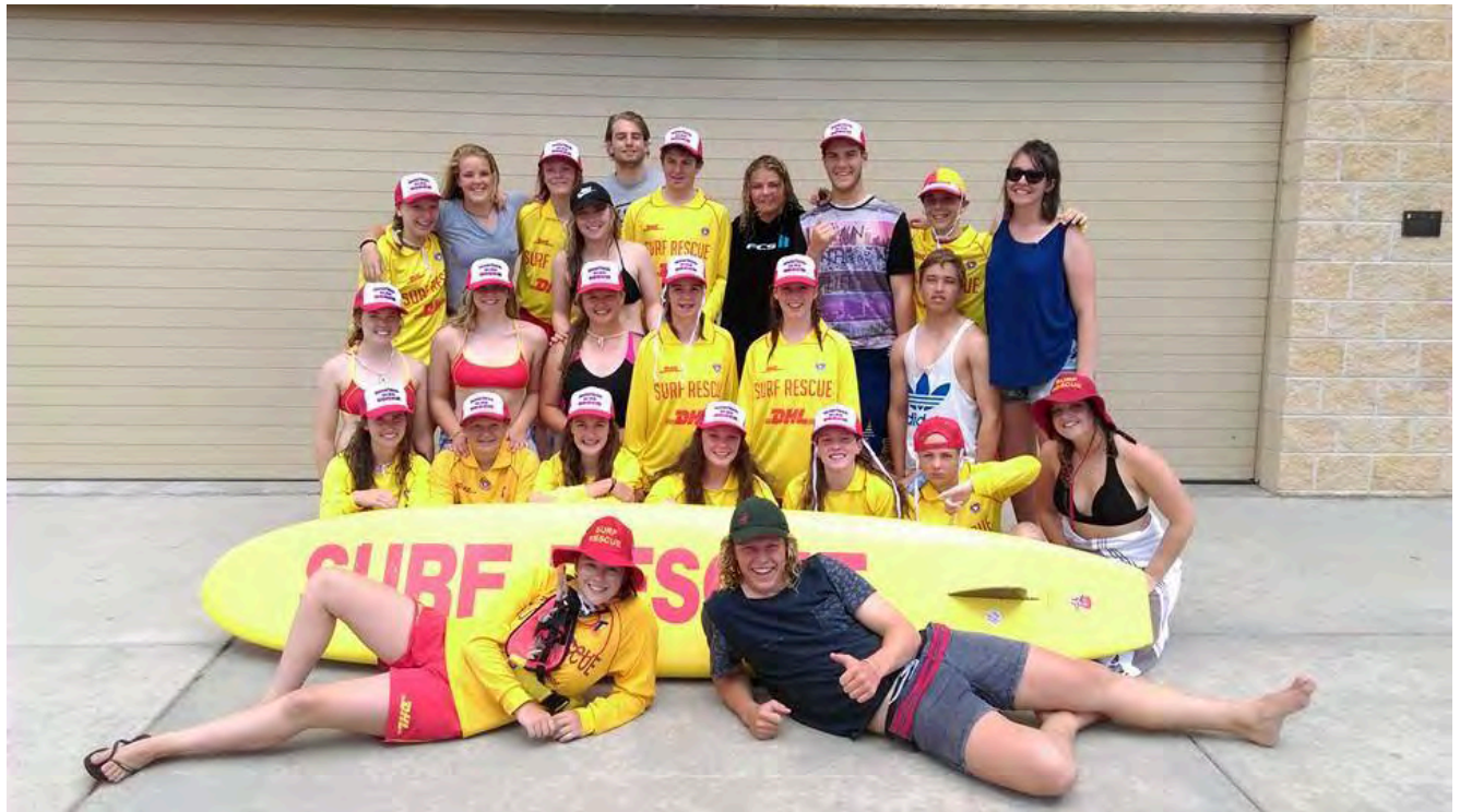
3rd Bronze Camp Participants & Trainers