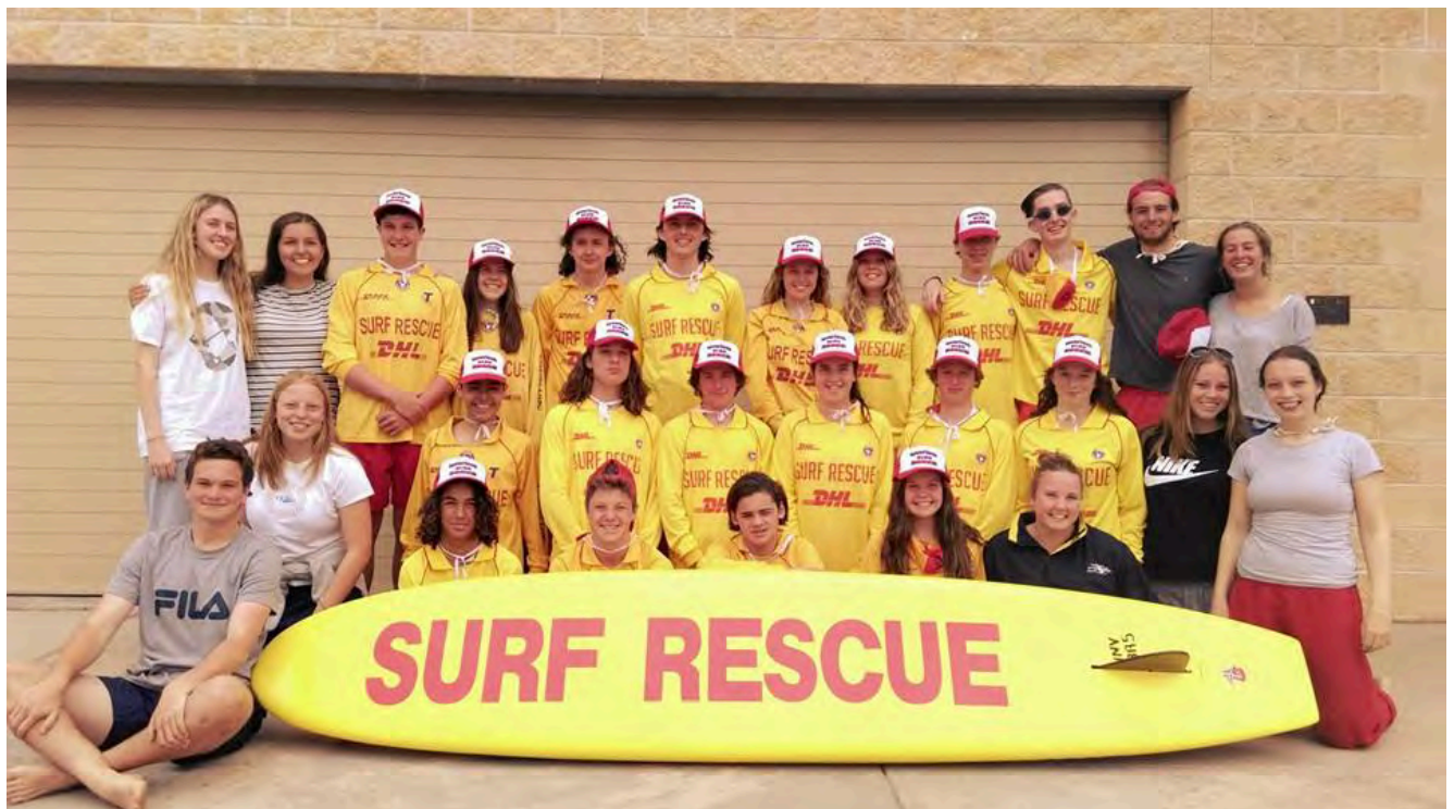
2nd Bronze Camp Participants & Trainers