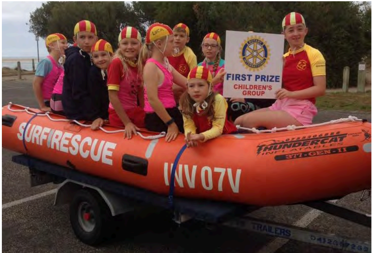
Nippers "On Patrol"