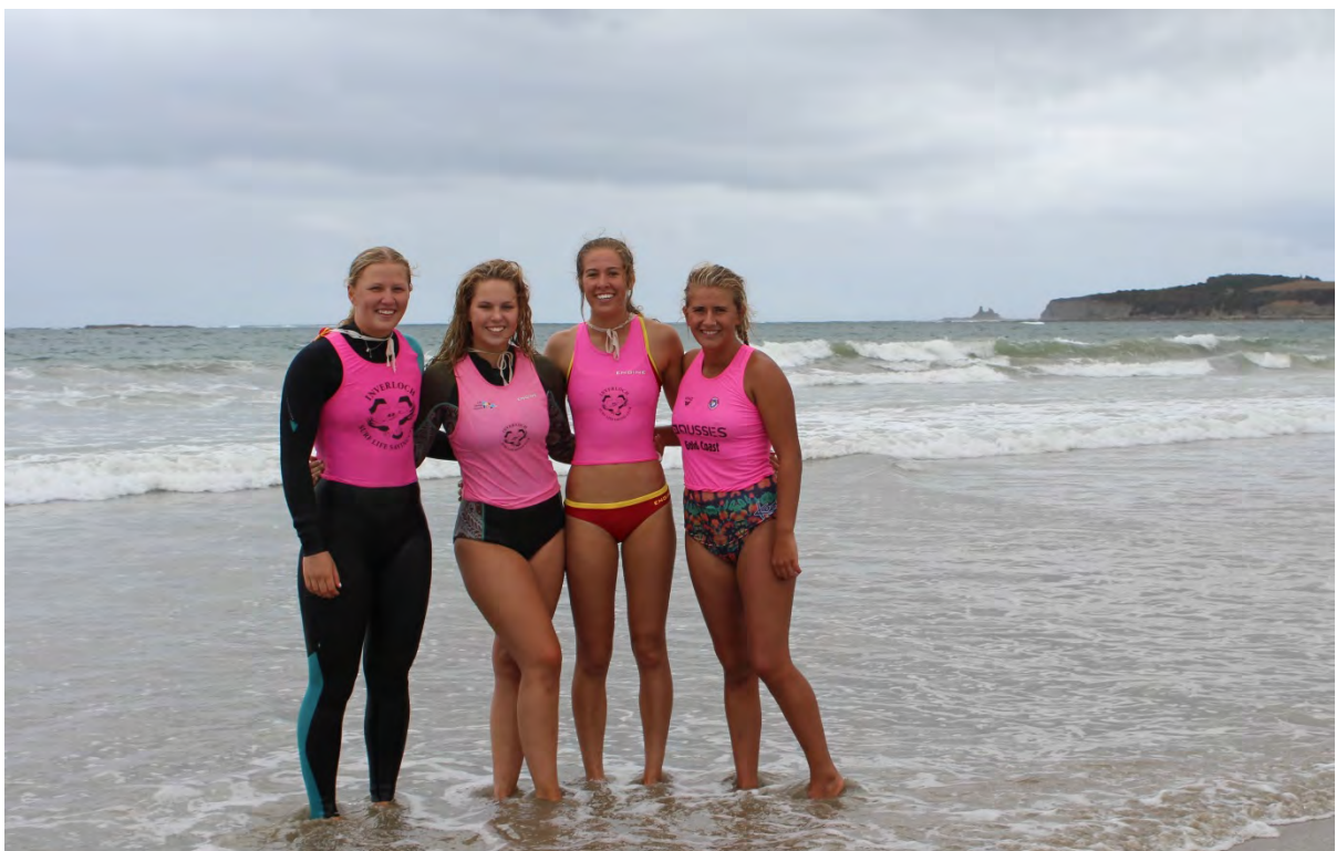
Bright smiles on a gloomy day at the 2015/16 Club Champs