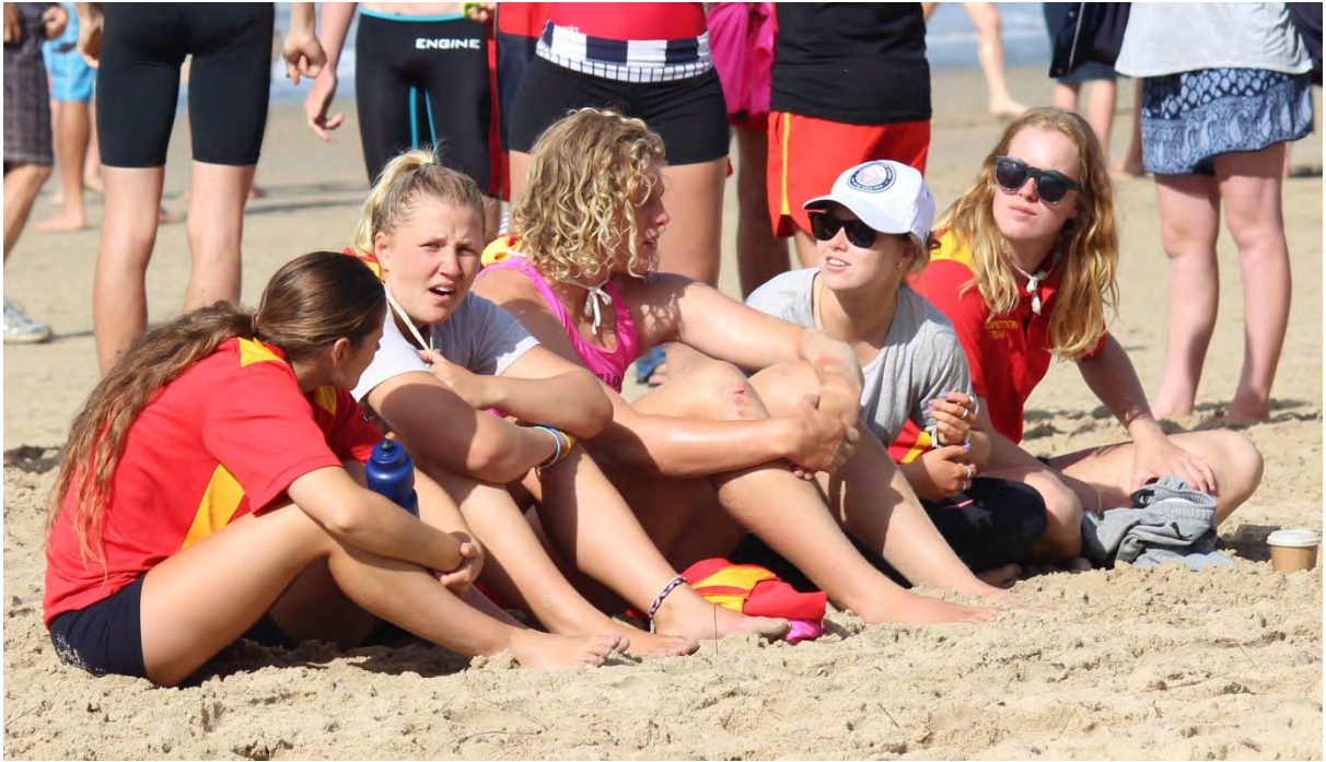
Relaxing between events at Point Leo Competition