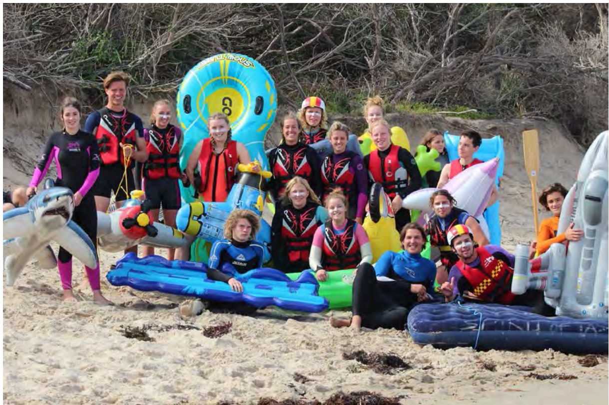
Inflatable Challenge Competitors