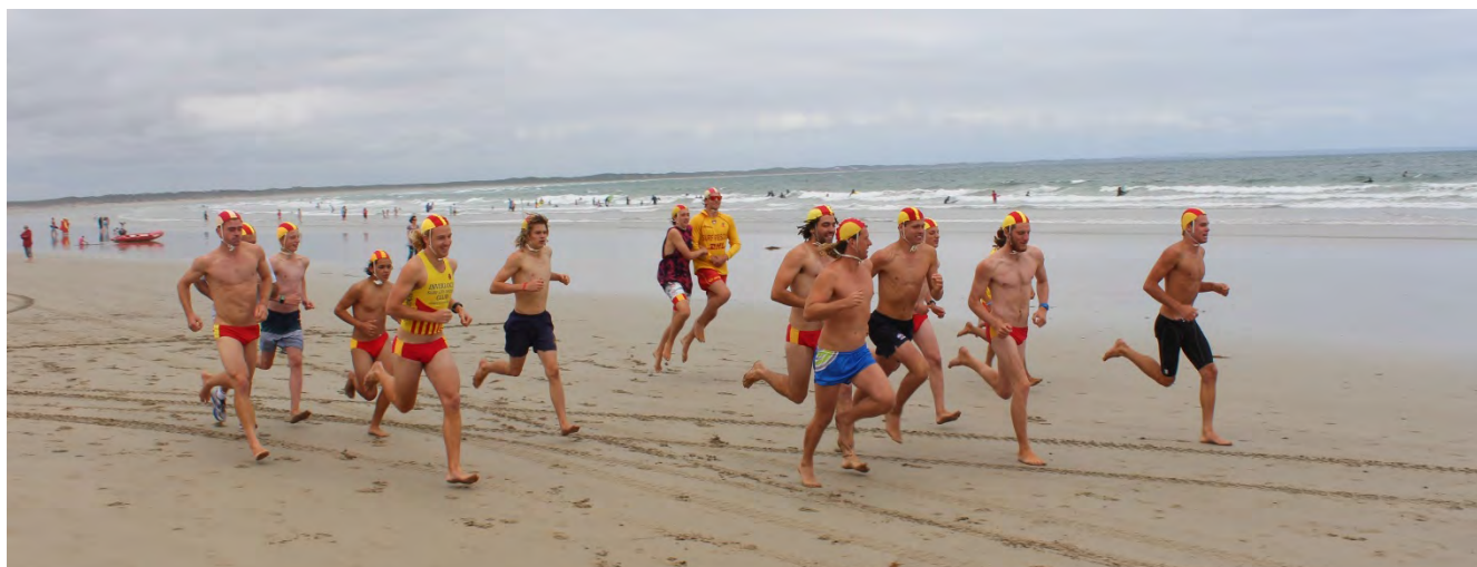
Male 2km Run at the 2015/16 Club Champs (All Ages)