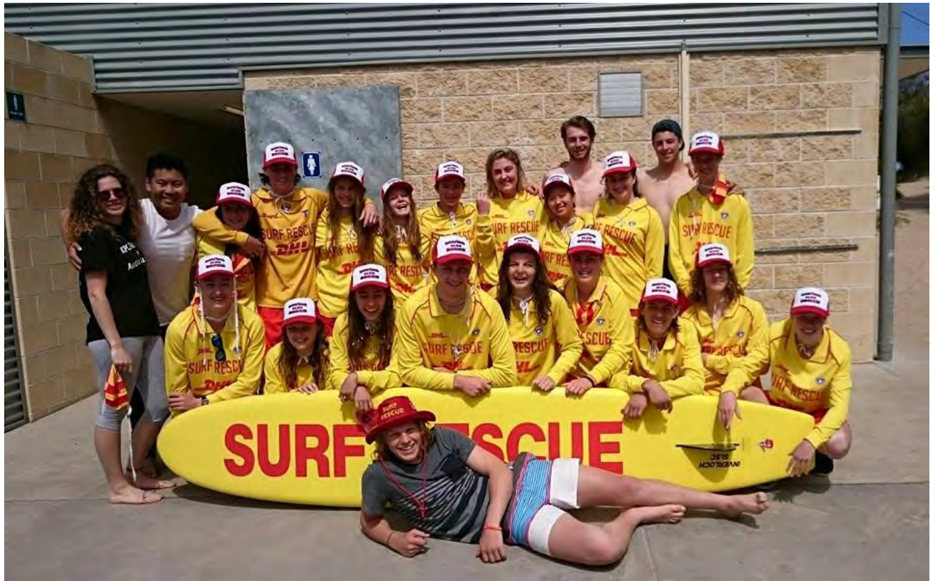
Kew High School Bronze Participants & Trainers