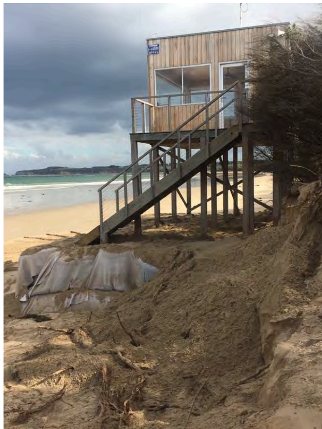
"I'm still standing"