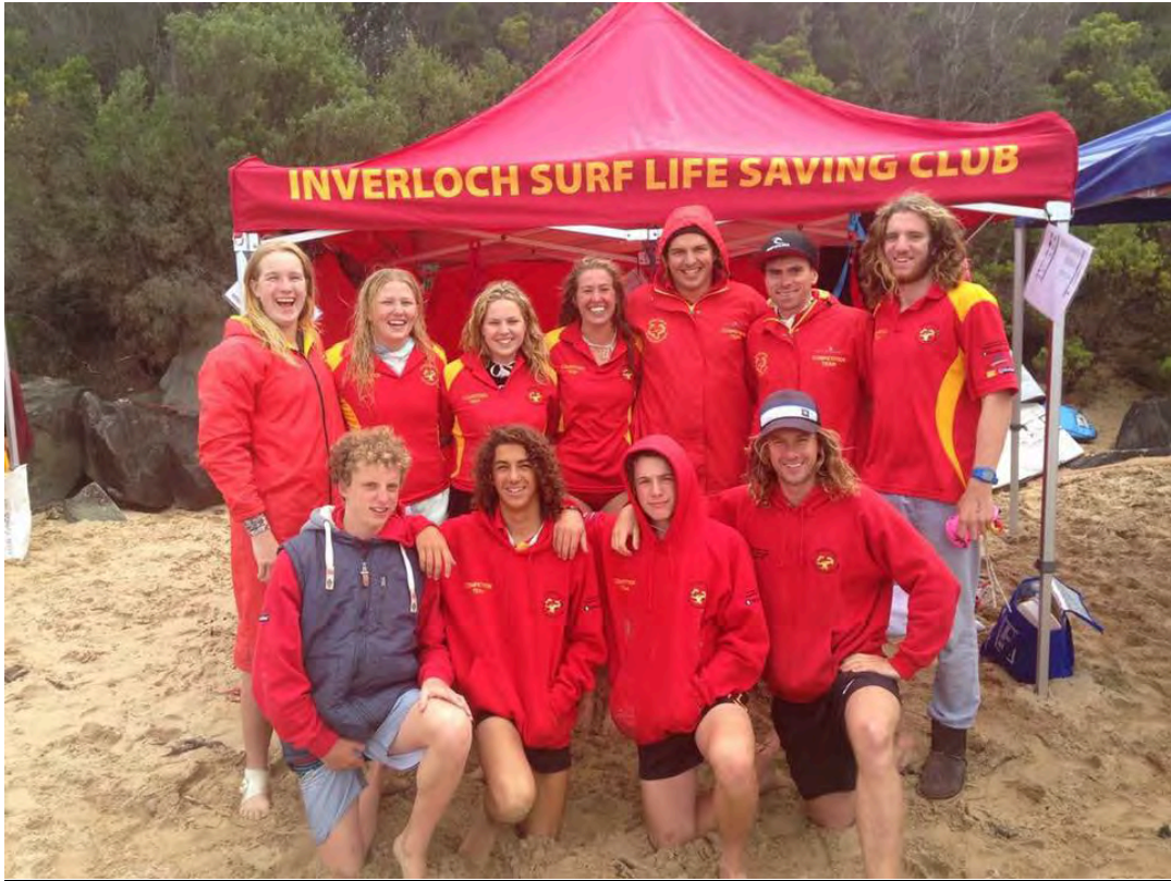
State Titles Team 2015/16