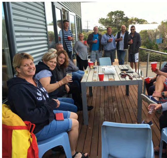
Welcoming the new Liquor Licence