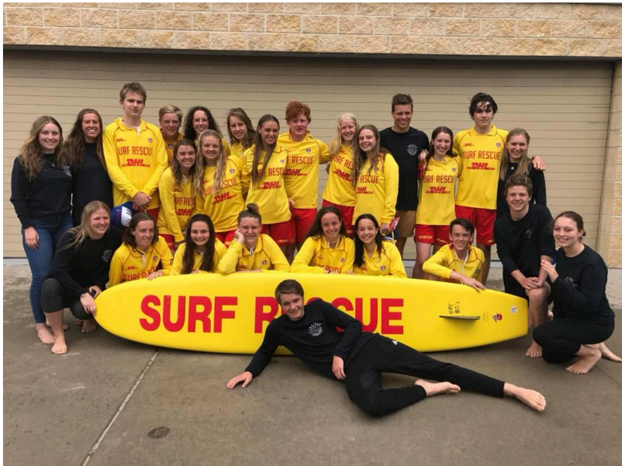
Bronze candidates with trainers and water safety

Special mention also to the wonderful Lorraine Ritchie for being an absolute 'Masterchef' catering for the week and Jake for assessing.