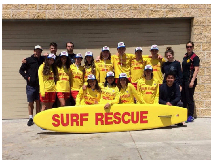
Kew candidates with trainers and teacher