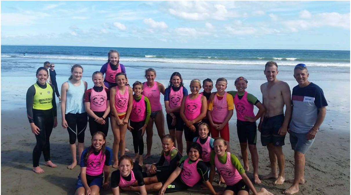
Training team at Inverloch