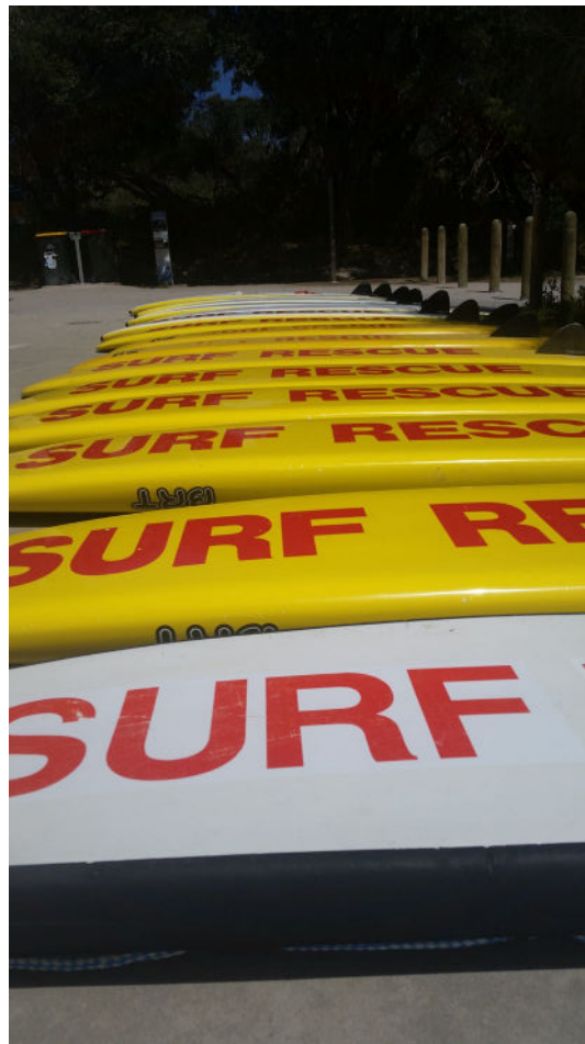
Gear check day