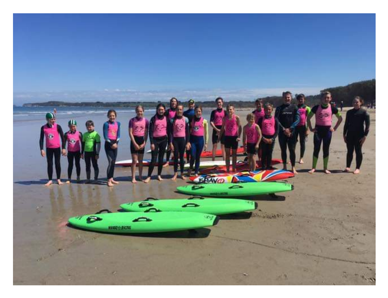
Early Summer Comp Training October 2018