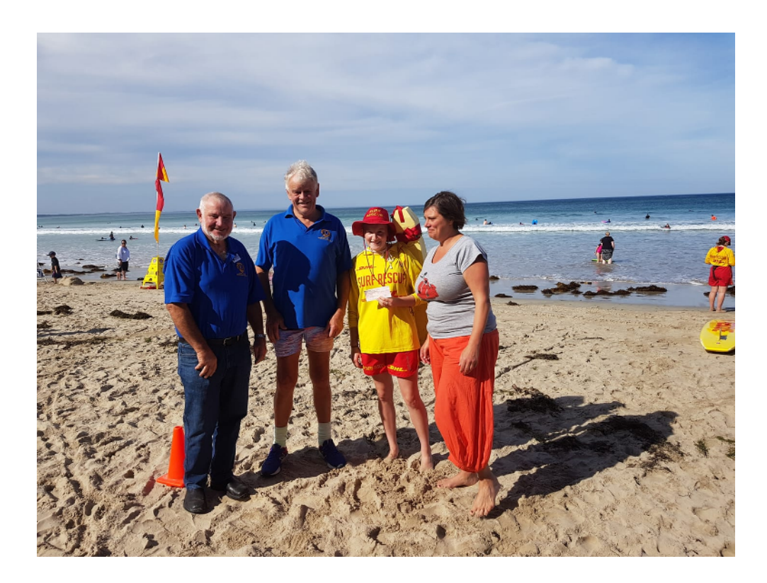
Inverloch Lions Club Donating $1K to the club

The financial statements presented are interim and have been prepared on a cash basis. They will be reviewed by our auditors and restated so they comply with accounting standards. The official financial statements will be circulated in September following the audit.