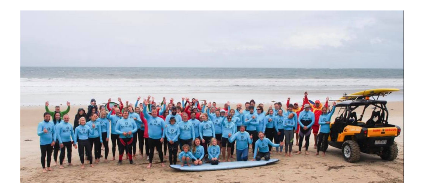
Disabled Surfers Day – February 2019