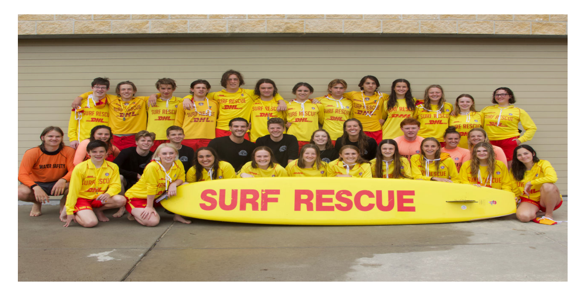
Bronze candidates with trainers and water safety