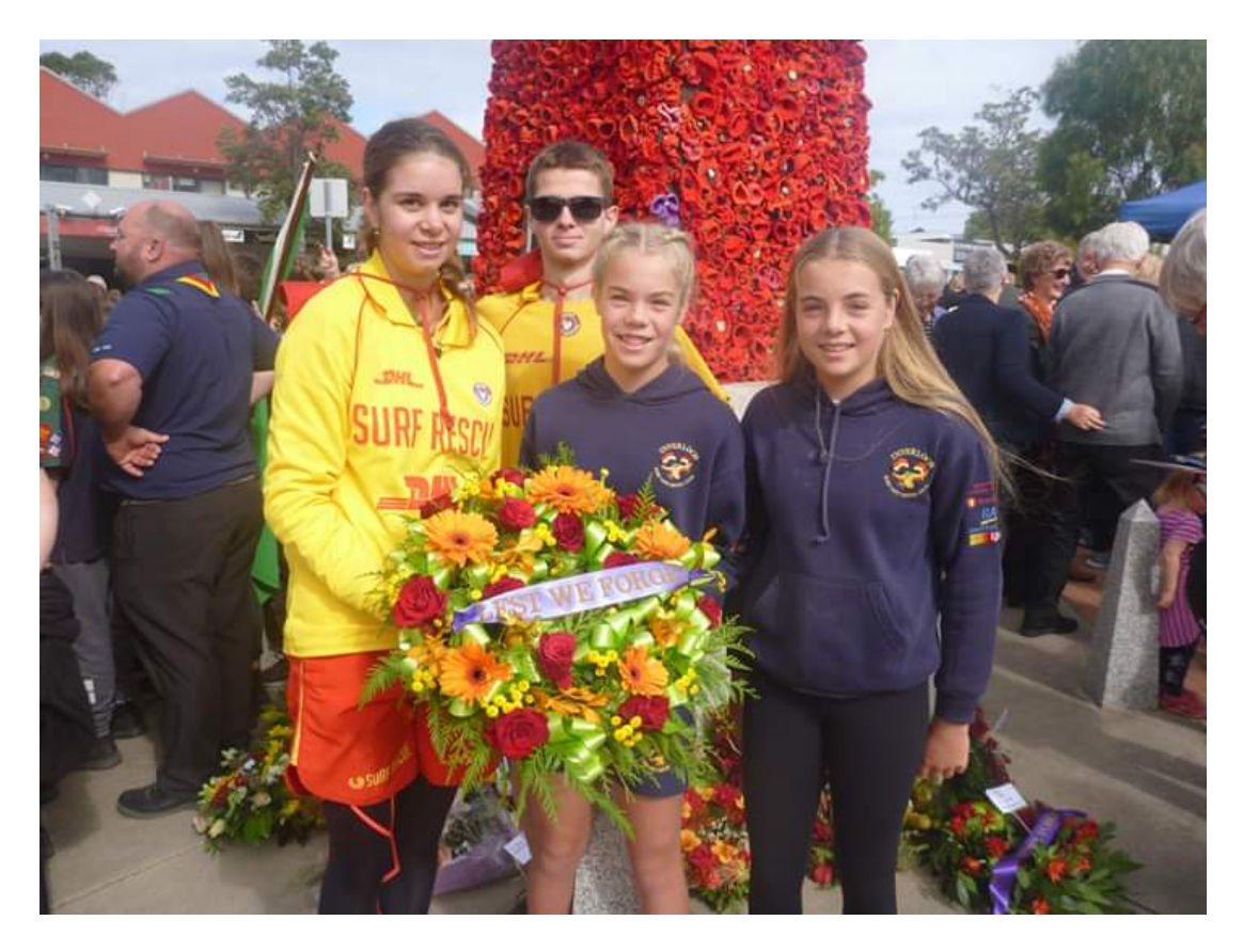
ANZAC Day Ceremony 2019

I look forward to seeing and catching up with all our members next season.