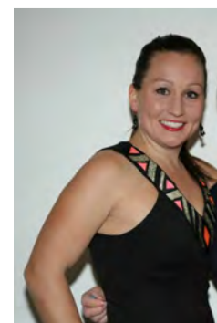
Open Women Club Champion