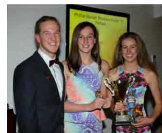
Female U15 Club Champions