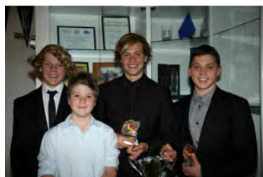
Male U15 Club Champions