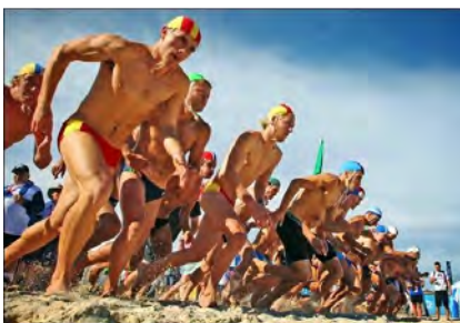
Inverloch Surf Lifesaving Club