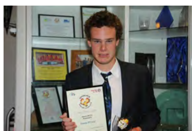
Junior Male Club Champion