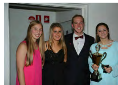
Junior Female Club Champions