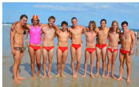
- 40 -