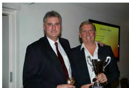
Masters Male Club Champ