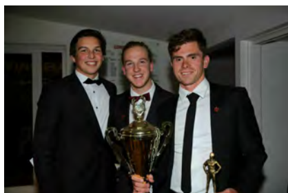
Open Men Club Champions