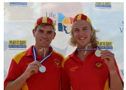
Annual Report 2012/2013