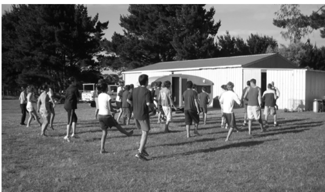
Bronze Camp 2005 Morning Exercises